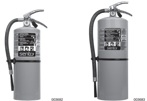
003682 SENTRY 10 LB EXTINGUISHER